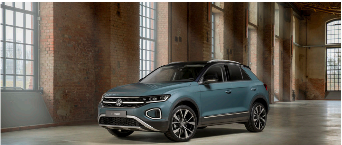
Note: The above image shows Style in Petroleum blue with optional 19" Misano Alloys

The above specifications are for information purposes only as our products are continually updated and changes may be made to the specifications at any time. If you require any specific feature, you must consult your local dealer who is regularly updated with any change in specification. Specifications are subject to change without notice.