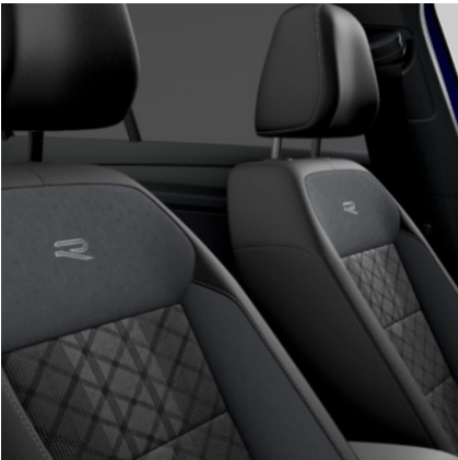
"Lava Stone Black" R-Line cloth Flint Grey/Black (OC) Standard on R-Line