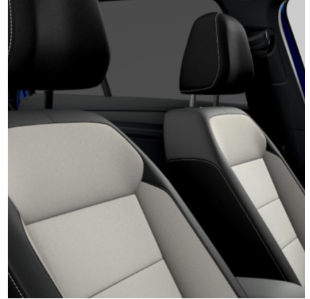
"Deep Iron Grey" ArtVelours cloth Storm Grey (XI) Standard on Style