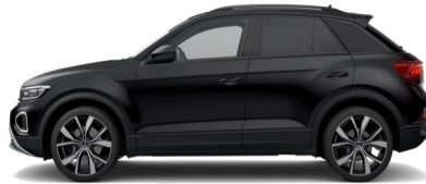
Deep Black Pearl Effect White Roof Grey Roof 2T2T 2T0Q 2TX3