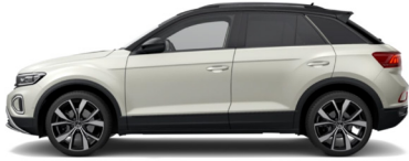
Ascot Grey Solid Black Roof White Roof 6U6U 6UA1 6U0Q