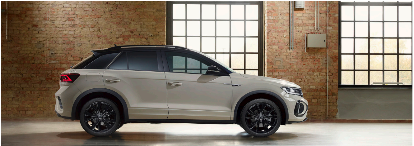
Note: The above Images shows optional 19" Misano Alloys in Black