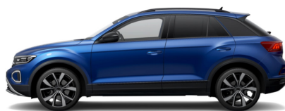
Ravenna Blue Metallic Black Roof White Roof 5Z5Z 5ZA1 5Z0Q