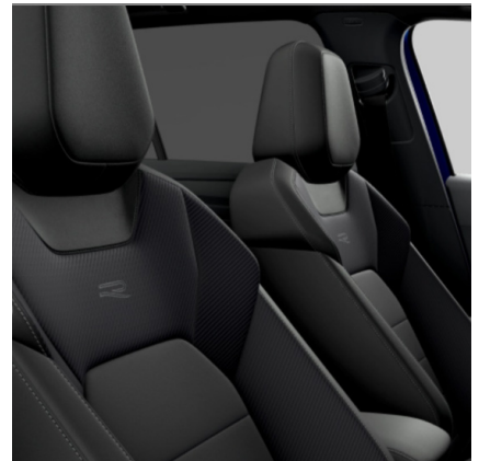
"Nappa Carbon Style" leather Black/Carbon (EM) Optional on R-Line