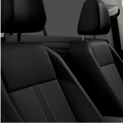
"Pewter Matte" cloth Titan Black/Ceramique (FJ) Standard on Life and Special Edition