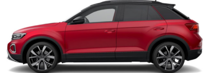
Kings Red Metallic Black Roof P8P8 P8A1