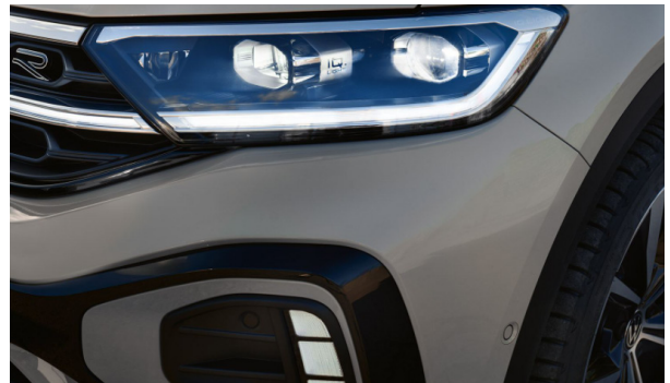
Note: The above Images shows optional IQ.Light