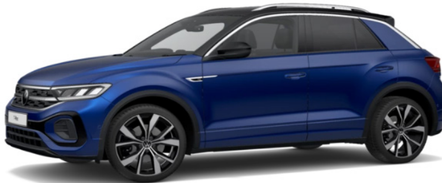
Note: The above image shows R-Line in Lapiz blue with optional 19" Misano Alloys

The above specifications are for information purposes only as our products are continually updated and changes may be made to the specifications at any time. If you require any specific feature, you must consult your local dealer who is regularly updated with any change in specification. Specifications are subject to change without notice.