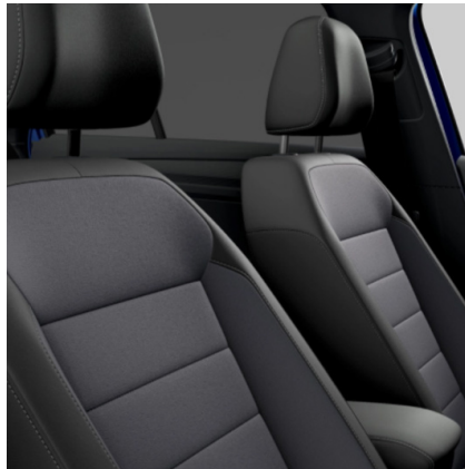
"Vienna" leather Platinum Grey/Black (LE) Optional on Style