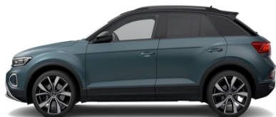
Petroleum Blue Metallic Black Roof Z3Z3 Z3A1