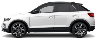
Pure White Solid Black Roof Grey Roof 0Q0Q 0QA1 0QX3